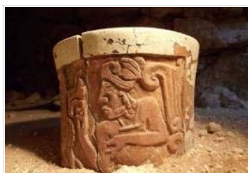
Uxul Archaeological Project, University of Bonn In the ruins of a royal complex in the Mayan city of Uxul, archaeologists found a tomb they believe belonged to a prince, who died 1,300 years ago. Here's one of the ceramic vessels they found buried with him.

Posted: 07/31/2012 12:31 pm Updated: 07/31/2012 2:11 pm